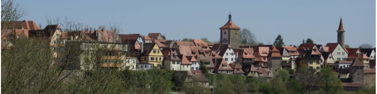
Rothenburg ob der Tauber