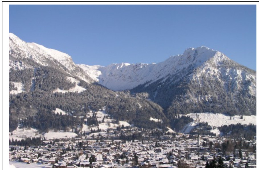
Panorama view of Oberstdorf